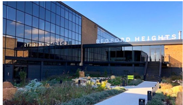
Headquarters Bedford Heights, Manton Lane Bedford, MK41 7NY, UK

Our heritage is in Defence Electronics and our culture is that of a company with history of servicing Blue Chip customers supplying complex solutions for life and mission critical systems.