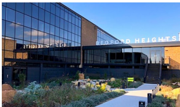
Headquarters Bedford Heights, Manton Lane Bedford, MK41 7NY, UK

Our heritage is in Defence Electronics and our culture is that of a company with history of servicing Blue Chip customers supplying complex solutions for life and